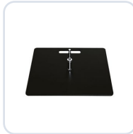
Ground Plate L