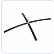
Cross Foot, indoor