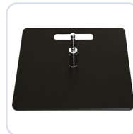
Ground Plate XXL