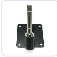
Wall mount 180°