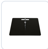
Ground Plate L