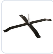
Cross Foot, outdoor