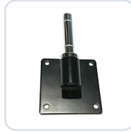
Wall mount 45°