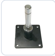
Wall mount 90°