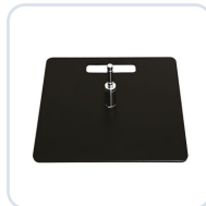
Ground Plate XL