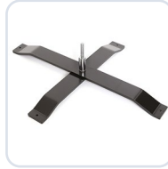
Cross foot, outdoor XL