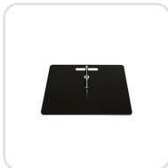
Ground Plate M