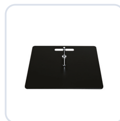
Ground Plate L, 10 kg