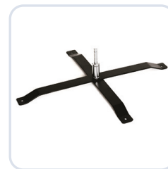
Cross Foot, outdoor