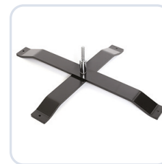
Cross foot, outdoor XL