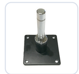
Wall mount 90°