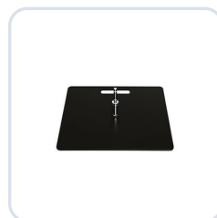
Ground Plate M, 5 kg