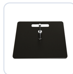
Ground Plate XL, 15 kg